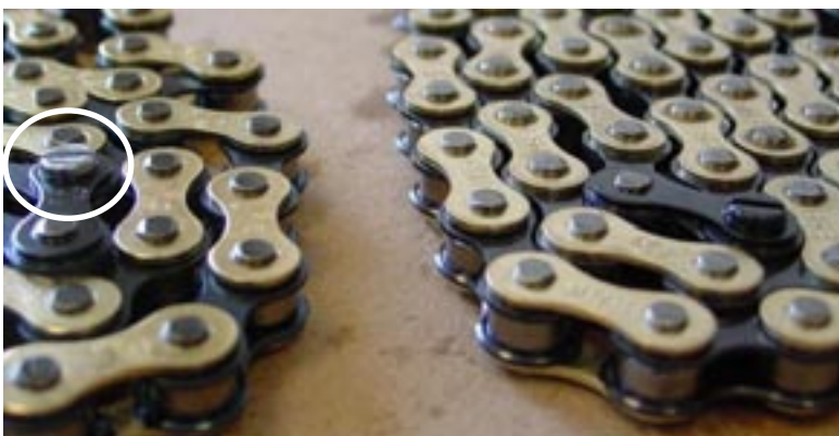
Notice the screwed in silver bolt on the Izumi V chain on the left?