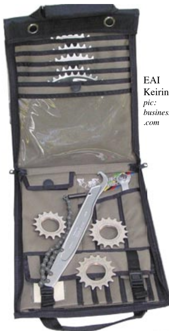
EAI Keirin Tote