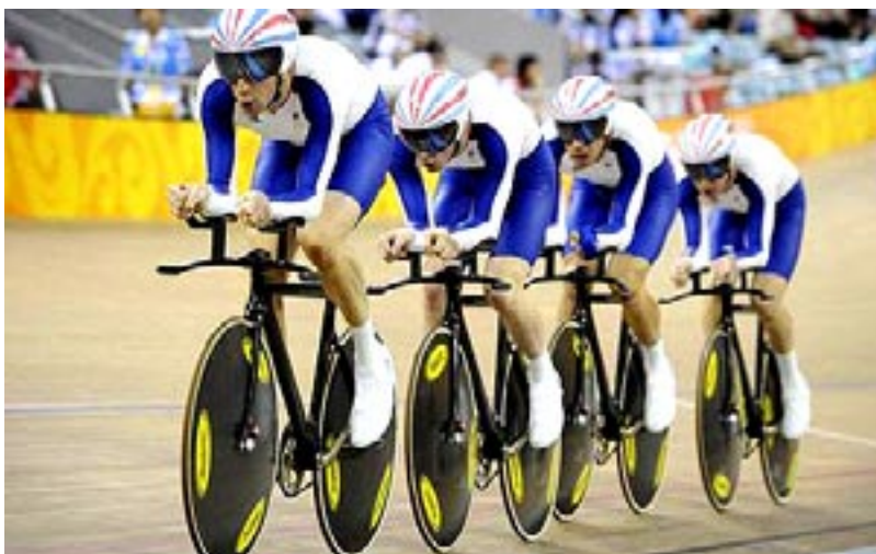
Great Britian full flight in Team Pursuit in Beijing.

These chains are not necessarily ideal for the application, but they are sufficient. That is to say, they are high quality road chains (the highest