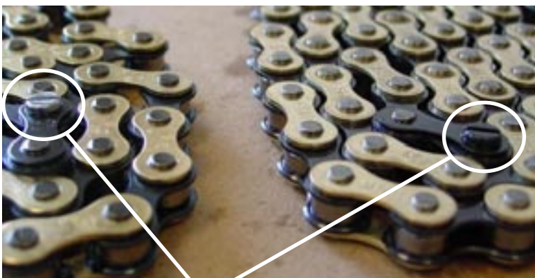
Notice the screwed in bolts on these Izumi V chains?