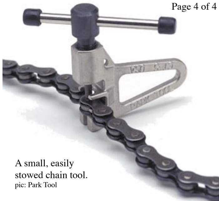
A small, easily stowed chain tool.

There has been plenty of success with both systems at the highest level. Unless the rider is over 180lbs (1/8 would be recommended) or under 130lbs (3/32), the choice between the two sizes would probably come down to what is available and if the shop you are working with has an existing stock in one width or the other. In this case it is probably best to let your decision be made by what is available. In either case, it is best to only have one width or the other in your track sack/gear tote, once you commit, to avoid any potential for accidental exchange of widths. E-bay the stuff that is not compatible, or trade it out with your buddy for what you need to find your “right gear.”